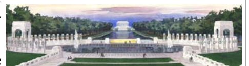
National Memorial in Washington, DC

The memorial is an exact copy of the pillar that is part of the World War II monument in Washington D.C. Each State has a pillar with their name on it, surrounding the pool of reflection.